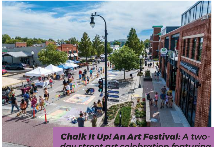
Chalk It Up! An Art Festival: A two-day street art celebration featuring more than 65 chalk artists, vendors, and live entertainment.