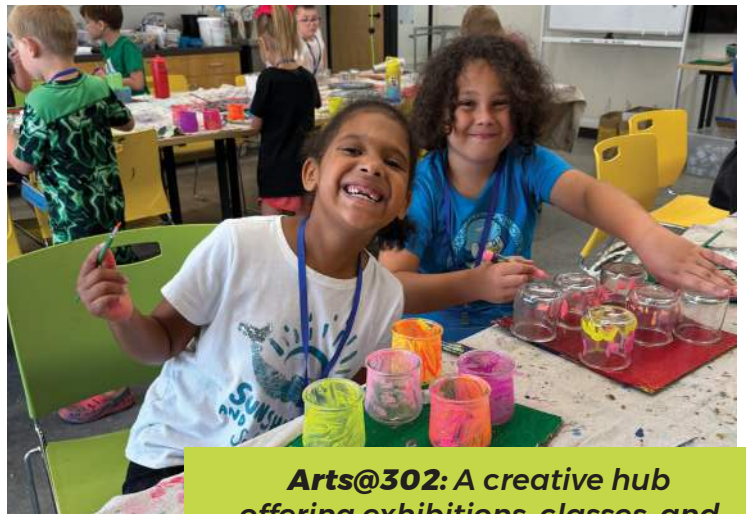
Arts@302: A creative hub offering exhibitions, classes, and scholarships for students from under-resourced communities.