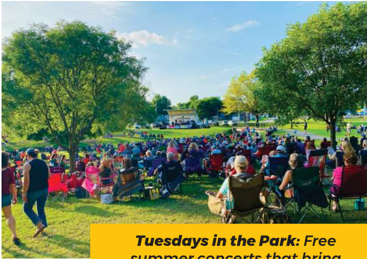
Tuesdays in the Park: Free summer concerts that bring thousands of families together for live music, food trucks, and fun.

Chalk It Up is produced by ARTSOK – The Regional Arts Alliance of Broken Arrow , a nonprofit organization dedicated to expanding access to arts experiences. Sponsorship support keeps Chalk It Up free to attend while funding concerts, youth scholarships, art programs, exhibitions, classes, and major performances throughout the year. As an independent nonprofit, we rely on donor support to keep these programs accessible to all—because art builds community, and together we make that possible.