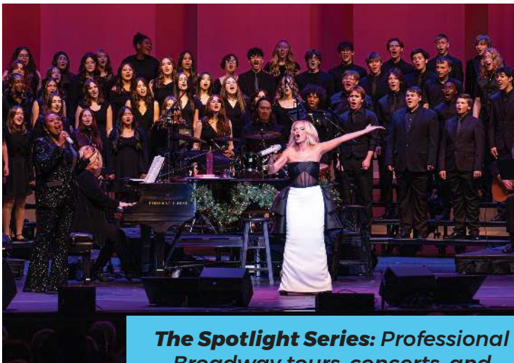
The Spotlight Series: Professional Broadway tours, concerts, and performances at the Broken Arrow Performing Arts Center.